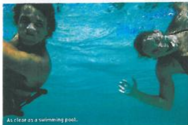
As clear as a swimming pool.