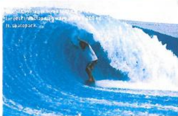
Local surfing is home here. The largest tropical wave pool is a 600 sq. ft. skatepark.